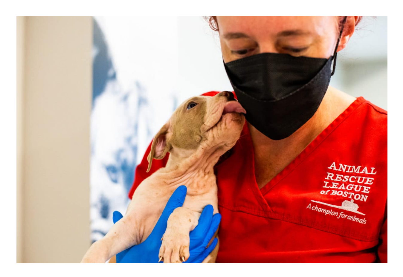
Randolph Police and the Animal Rescue League of Boston removed 24 dogs from a home, on Wednesday, Aug. 4, as part of an animal cruelty case. (Photo courtesy Animal Rescue League of Boston)

*Additional photos of the dogs, courtesy the Animal Rescue League of Boston, can be viewed and downloaded here.*